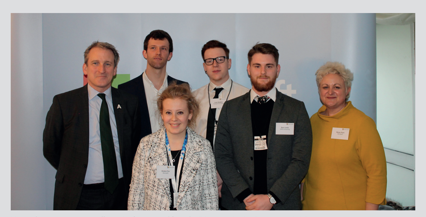
Microsoft apprentices and staff with the Secretary of State for Education, Rt Hon Damien Hinds MP

Al is a good example. Al skills are needed now which is why Microsoft has recently launched its Al School to train 500,000 people in Al skills - this may not be available for apprentices but apprentices cannot wait for another three-year review cycle to come around in order to update the standard. This timeline simply does not match the country's skills needs. How content is delivered also needs specific consideration. One of the reasons for the success of Microsoft apprenticeship programmes has been the relevance of curriculum, the way teaching maps closely onto real-world needs and the speed at which Microsoft's learning partners have been able to adapt to technological change. This clearly demonstrates the pivotal role of these providers in the continued success and growth of vital digital skills in the UK.